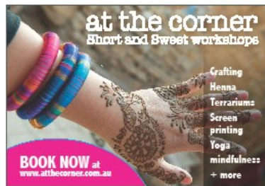
PRINT AD SPRING 2016