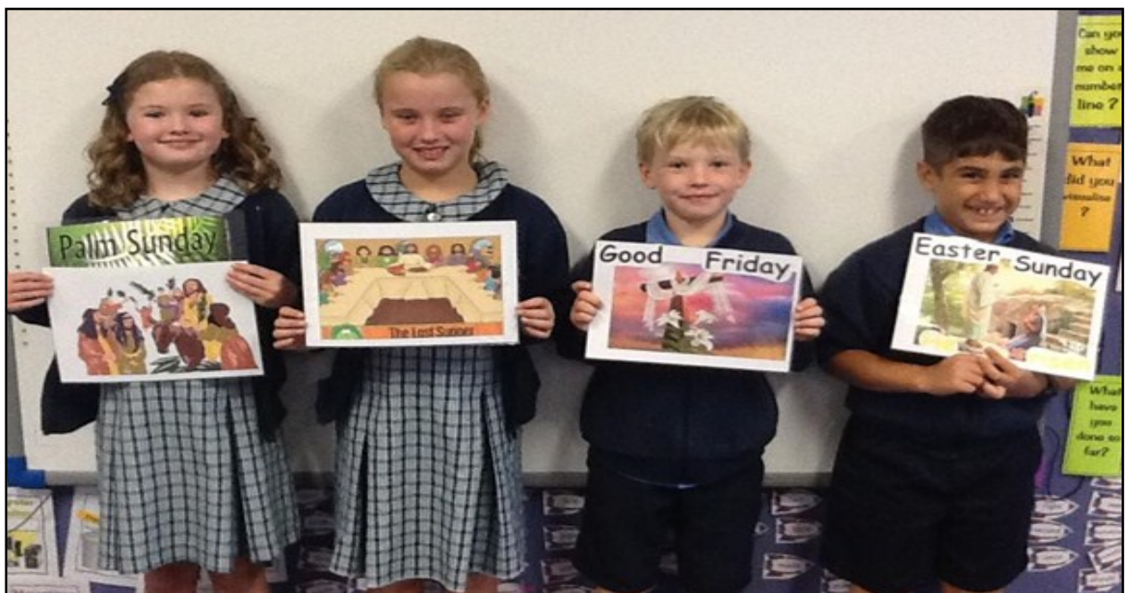
The events of Holy Week