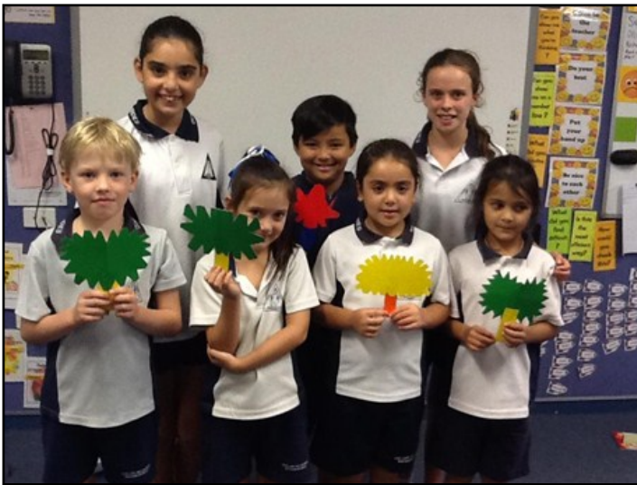
2P made Palms with Year 6

This term, Year 2 has been on a spiritual journey towards the celebration of Easter. The children have enjoyed discussions about prayer and written Lenten promises, detailing their intentions to keep God close over the 40 days of Lent. We have explored scripture, including Jesus, Lost in the Temple. We also focused on The Garden of Gethsemane, which enabled the children to understand the agony Jesus felt in his final hours before being put to death on the cross. The children were involved in scripture plays, watched film clips and mimed Bible events through role plays to ensure the children had a thorough understanding of the events of and leading up to Holy Week.