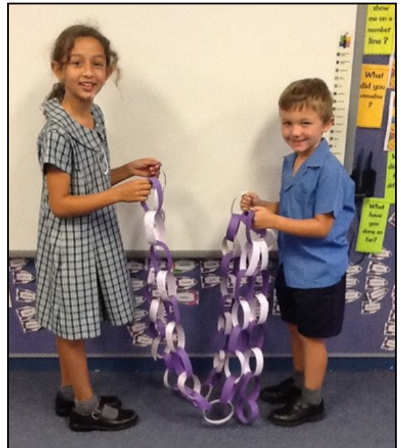
Our Lenten Promises